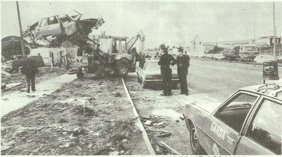
A common sight in and around the Dublin County area.