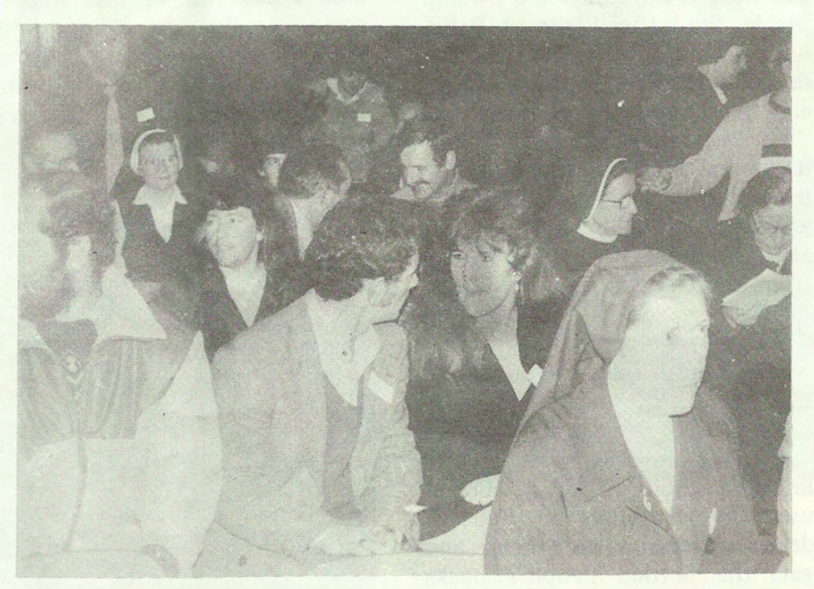
A section of the crowd at the National Committee for Travelling People annual Conference.