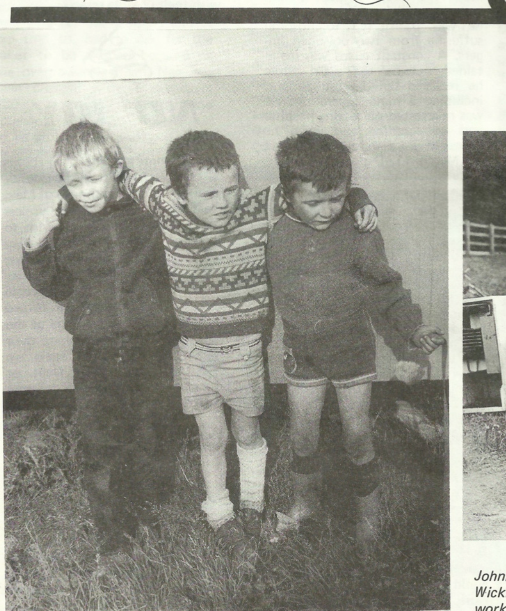
Three of the boys pose for our photographer in the Tallaght area.

If you have any issue you want highlighted in Pavee, contact us and Pavee will print it.