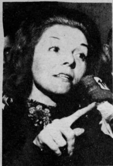
ISABELITA DELIVERING SPEECH (1973)

Argentina is a big country and the American capitalist companies operating in Argentina in particular and the rest of Latin America in general, reap very big profits from the over-exploited land and labour. In fact it is accurately estimated that for every American dollar put in the American and foreign capitalists, including Britain, take out ten dollars in return. Not bad when you consider it is all 'tax free' - an added incentive from the corrupt Argentinian government which is headed by President Isabelita Peron (wife of the deceased President Juan Peron who died in July 1974). Like her husband she is totally dedicated to ensuring that the big businesses of all countries and herself, reap big profits also.