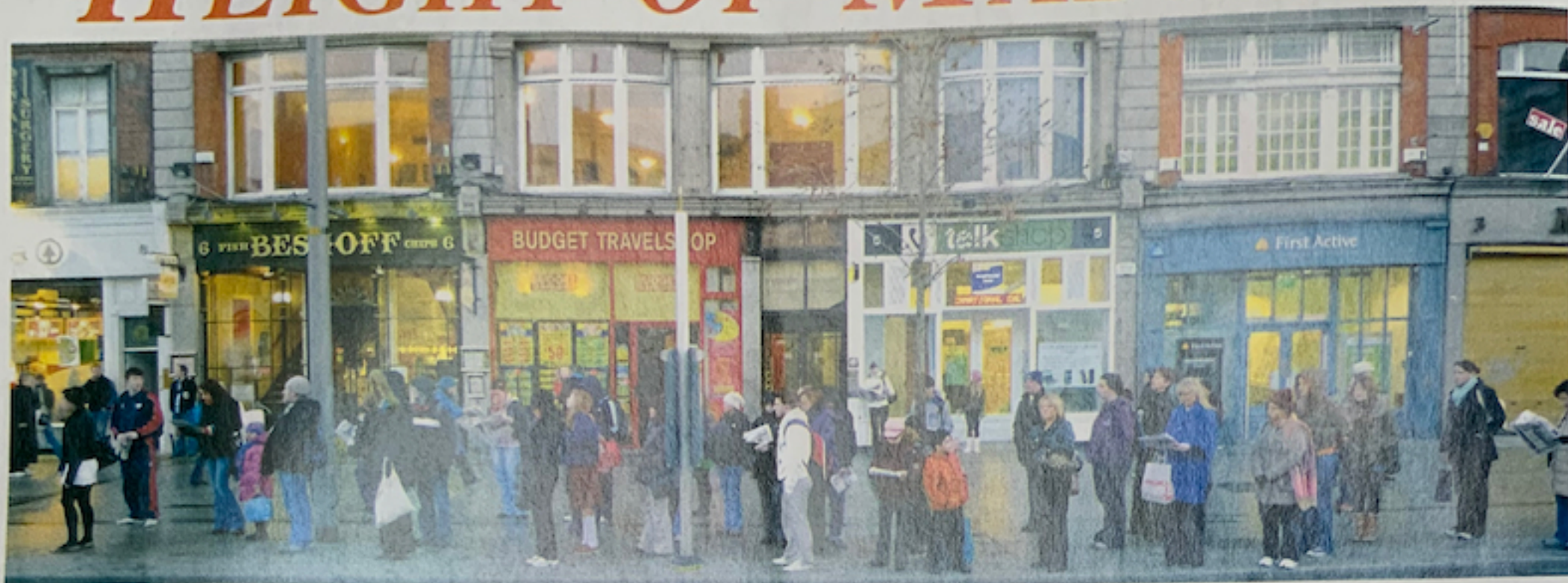
A Bus Queue building up in O'Connell Street Dublin

In a time of recession the demand for public transport always grows - but the government is making CIE cut back on service. They claim that Dublin Bus and Bus Éireann are losing passengers.