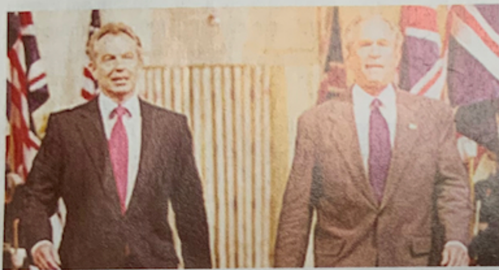
The Bush-Blair legacy - Six years of slaughter

It has been a most terrible and bloody 6 years. Over 4,000 US/UK soldiers have been killed in Iraq with thousands more maimed and injured. There is no accurate figure for the number of Iraqi civilians killed but reliable sources estimate about 1,000,000.