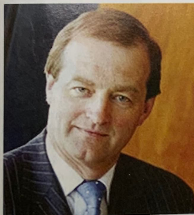
Brian Goggins, CEO of Bank of Ireland - whinging that he would only earn €2 million this year.

So far the banks themselves are the only real winners. Six months ago they were given a state guarantee for all their deposits and all the borrowing they had undertaken. The full value of this guarantee is estimated at €400 billion. Last month they were given €7 billion in actual cash.