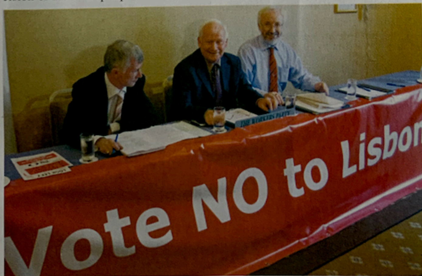
The Workers Party is very clear. The Irish people have spoken. NO means NO.