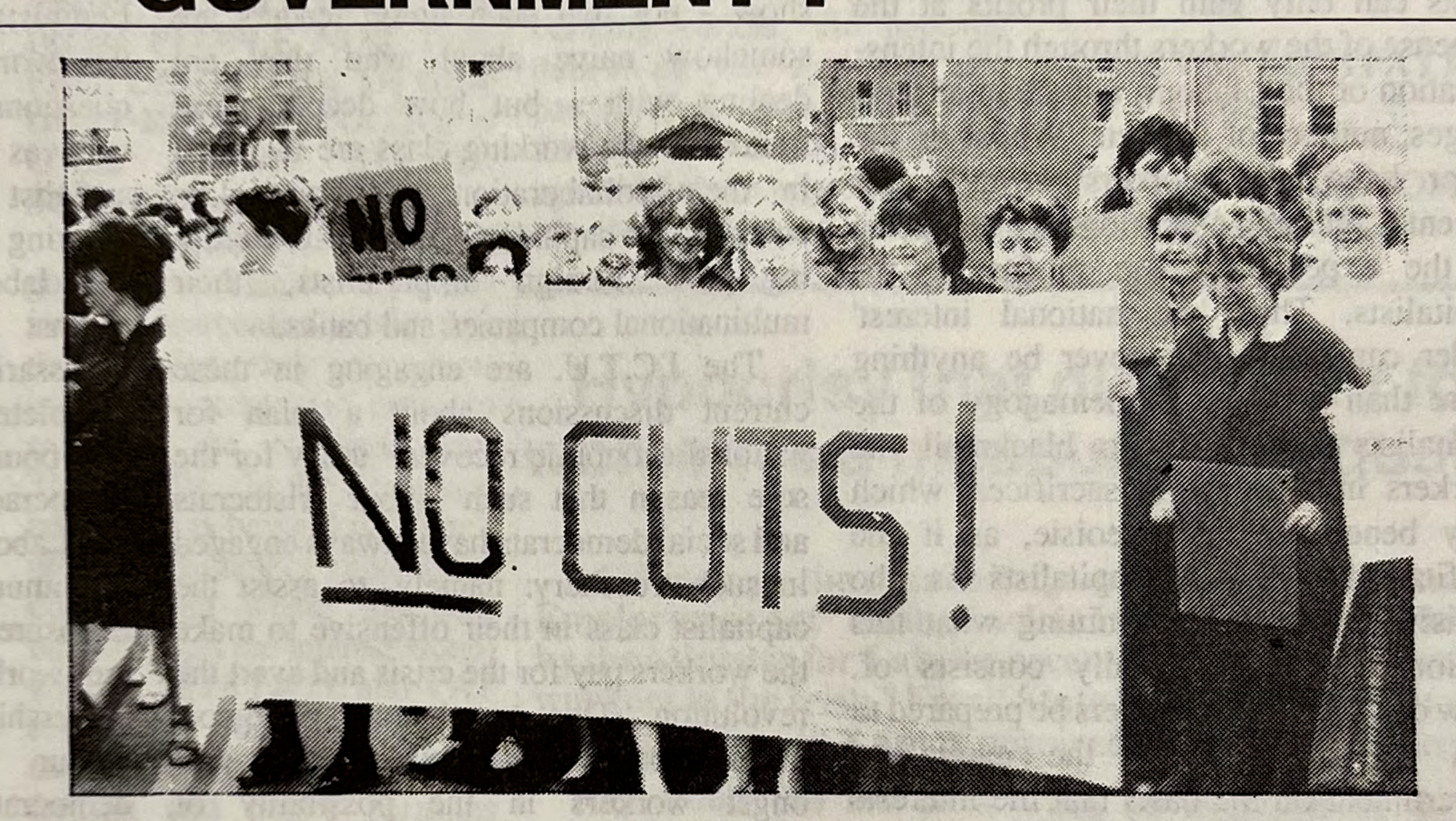
ST JAMES HOSPITAL, DUBLIN, WORKERS DEMONSTRATION IN PROTEST AT GOVERNMENT CUTBACKS IN HEALTH SYSTEM AND HOSPITAL JOBS -

Not at all. For whilst the claims of those previous 'planning initiatives' all - without exception - proved to be comunions conducting this kind of discussions with the government in the first place, when government policy, as shown by the recent budget, is straightforwardly to launch the most savage offensive against the wages, jobs and living standards and social welfare, health and educational entitlements of the masses of the Contd. on P.2 - UNIONS