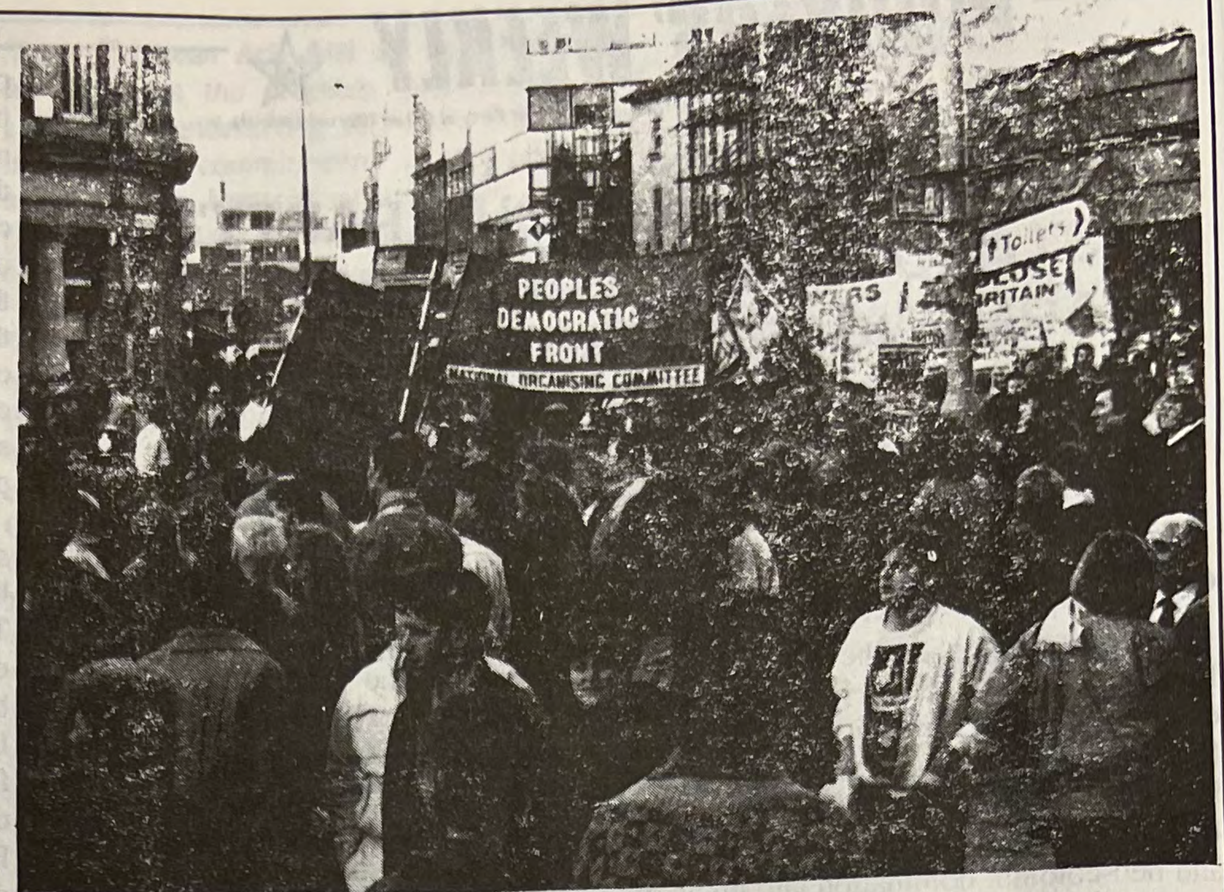
PHOTOGRAPH SHOWS 3,000 STRONG DEMONSTRATION IN SHEFFIELD IN FEBRUARY ON THE 15th ANNIVERSARY OF BLOODY SUNDAY

Whilst pursuing the same policy on Ireland, Labour differs from the Tories in the fact that it presents itself as having a diffserent long-term aspiration. Thus for