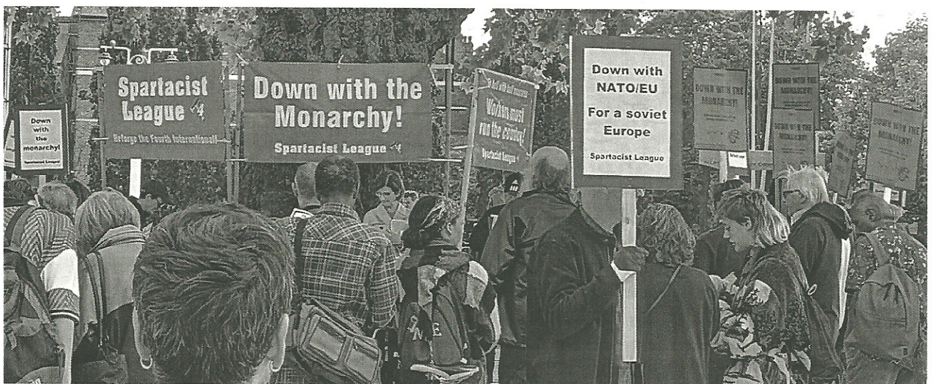
19 September: Rally in Windrush Square, Brixton, on day of Elizabeth II's funeral.

Our main speaker denounced "the monarchy and the United Kingdom" as "a prison for Scotland, Wales and Northern Ireland's Catholics" and King Charles III as the "colonel-in-chief of the brutal Parachute Regiment that shot and killed 14 people on Bloody Sunday in Derry in 1972". She hammered on the urgency of workers opposing the monarchy, taking power and running the country.