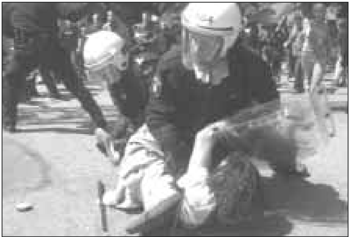
Over 600 were arrested and many more injured

Banners on the demonstrations read "Smash Capitalism," "Nature Not Profit, End Neo-liberalism," "Our World Is Not For Sale," "Shut Down Fortress Europe" and "US-EU Peace Policy Equals Support For Israeli Aggression."