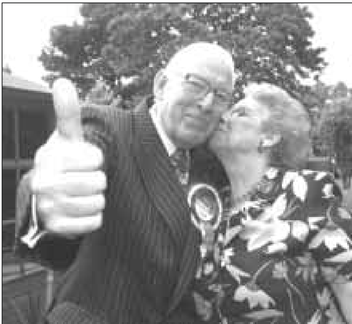
IAN PAISLEY- All smiles for the camera!

The UUP have the deserved reputation of being the 'fur coat brigade', representing rich Protestants. The DUP have managed to present themselves as more in touch with poorer Protestants even though DUP leaders like Ian Paisley and Peter Robinson are notorious for