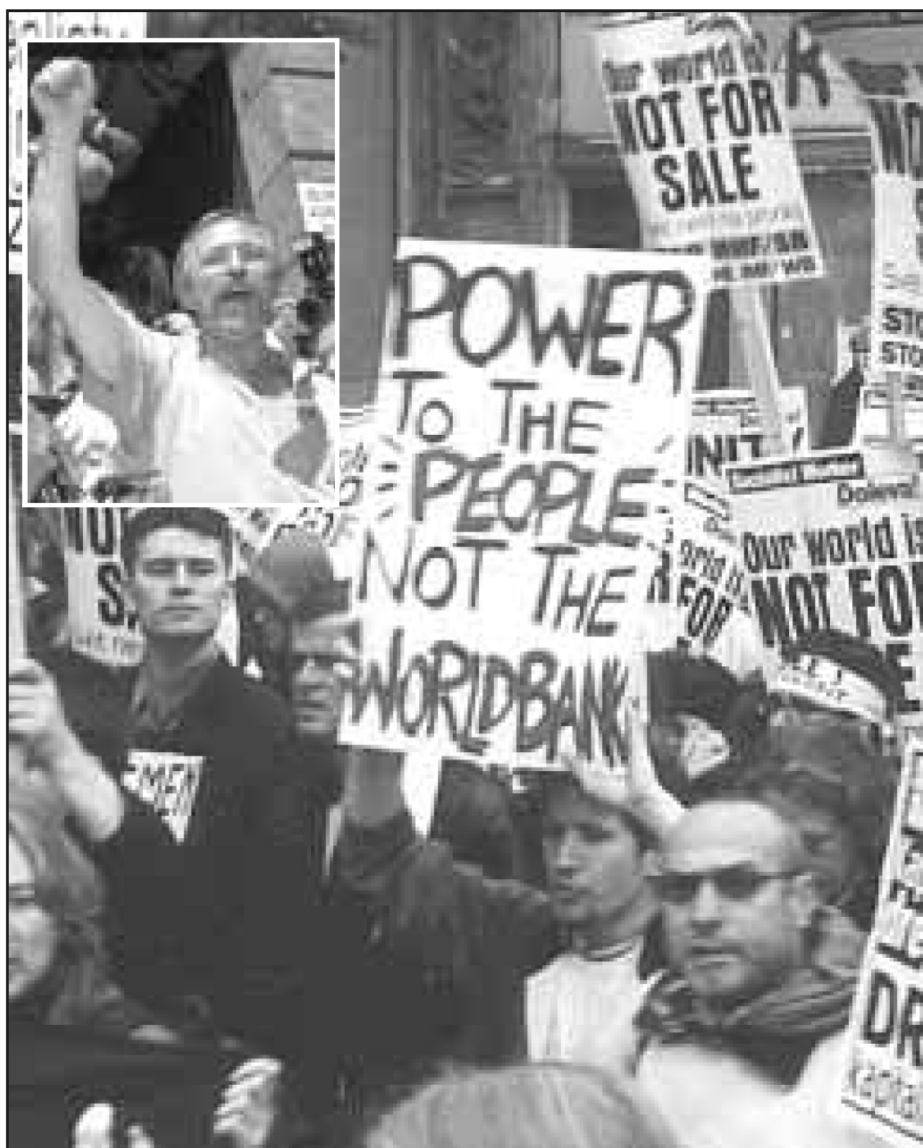
JOSÉ BOVÉ (inset) and anticapitalist protests in Prague last year

If you don't have the little fights you won't have the big fights. Also, you get all these people pushed into struggles, whether as workers, farmers or people who have had to leave their countries to