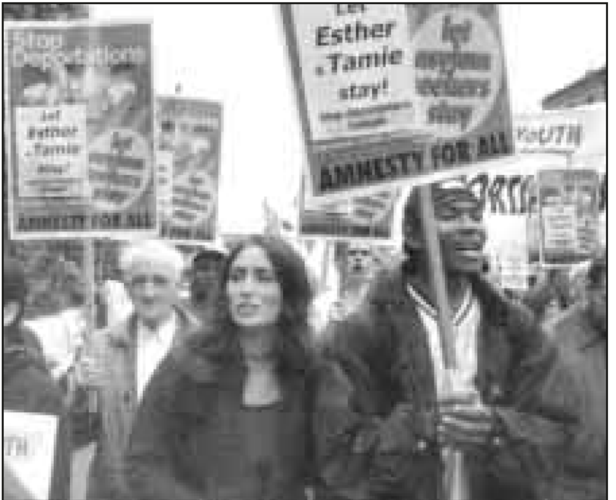
SOME 600 people marching against deportations in Dublin

The Tallaght Stop Deportations Campaign have taken up Esther's case. If you want to get involved in building support, ring: 01-872-2682