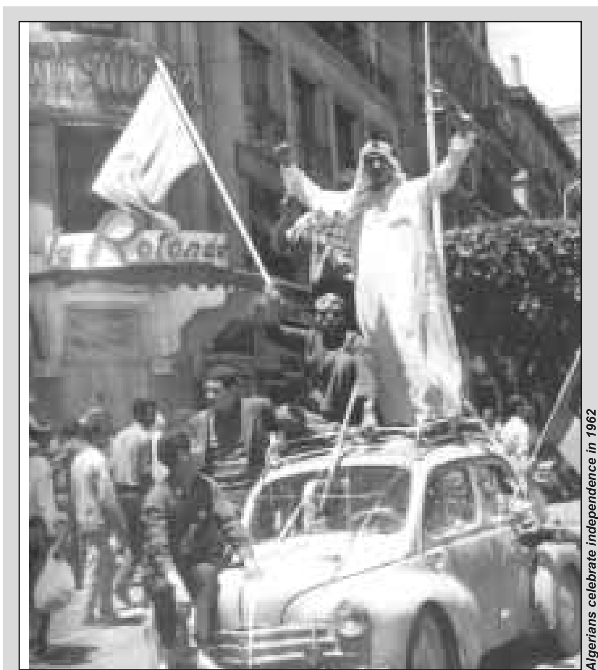
Algerians celebrate independence in 1962

In the city of Algiers the Muslim quarter known as the Casbah was home to over 100,000 Muslims despite being only 1 square kilometre.