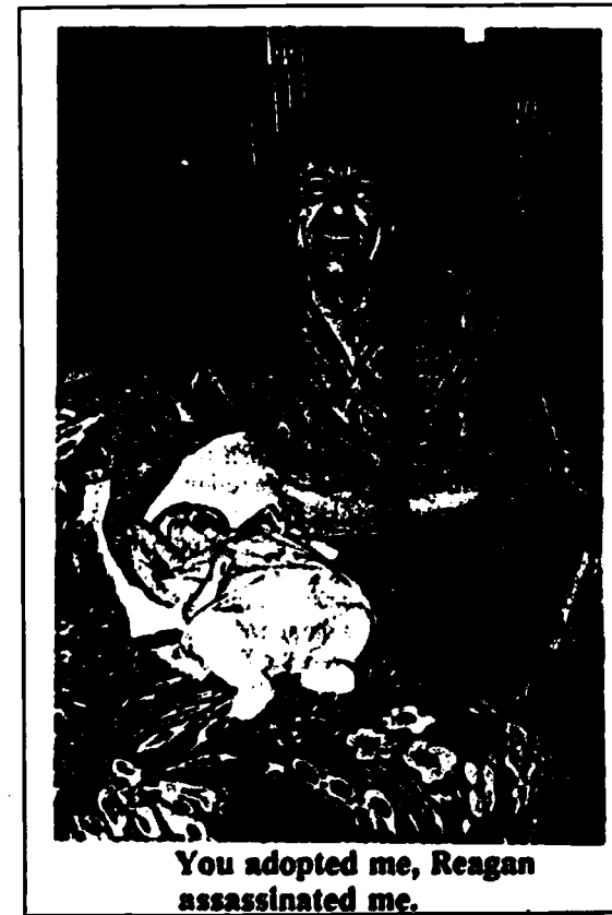
You adopted me, Reagan assassinated me.

NOTE: The cost of this Open Letter has been defrayed by the contributions of Irish nationals and Argentine nationals of Irish descent all resident in Argentina.