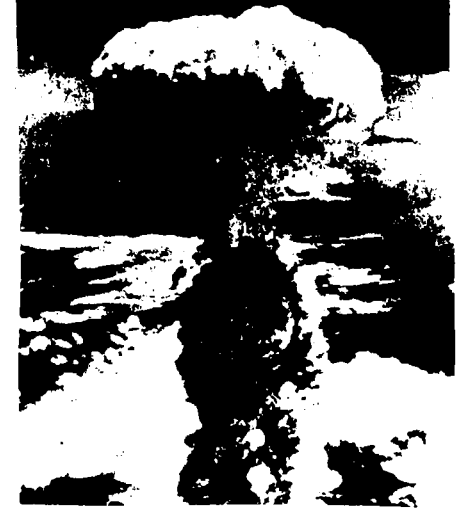
THE ULTIMATE VIOLENCE