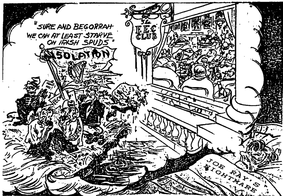
THE I.F.A. RIP VAN WINKLE IN SLUMBERLAND

Without a mass movement, involving the mass conversion and politicisation implied in such a social transformation, the physical force aspect of national liberation must inevitably come to the fore, for the job must be done somehow, if Ireland is to be saved from foreign and domestic predators. But the leaders of the struggle must endeavour to keep the mass movement intact, and, regardless of even the violence of murderous provocation, (as was perpetrated on the Civil Rights Movement in the North, by the action of British agents in the Bombay Street programs of 1969, or the direct action of the British Army in the murderous shooting down of unarmed Civil Rights demonstrators at the end of January, 1972), they must keep to the political struggle and avoid precipitate armed retaliation. If force is demanded, it must be with "votes and law" on our side. Until then, Gandhi's principle is the only solution. It is the people who must