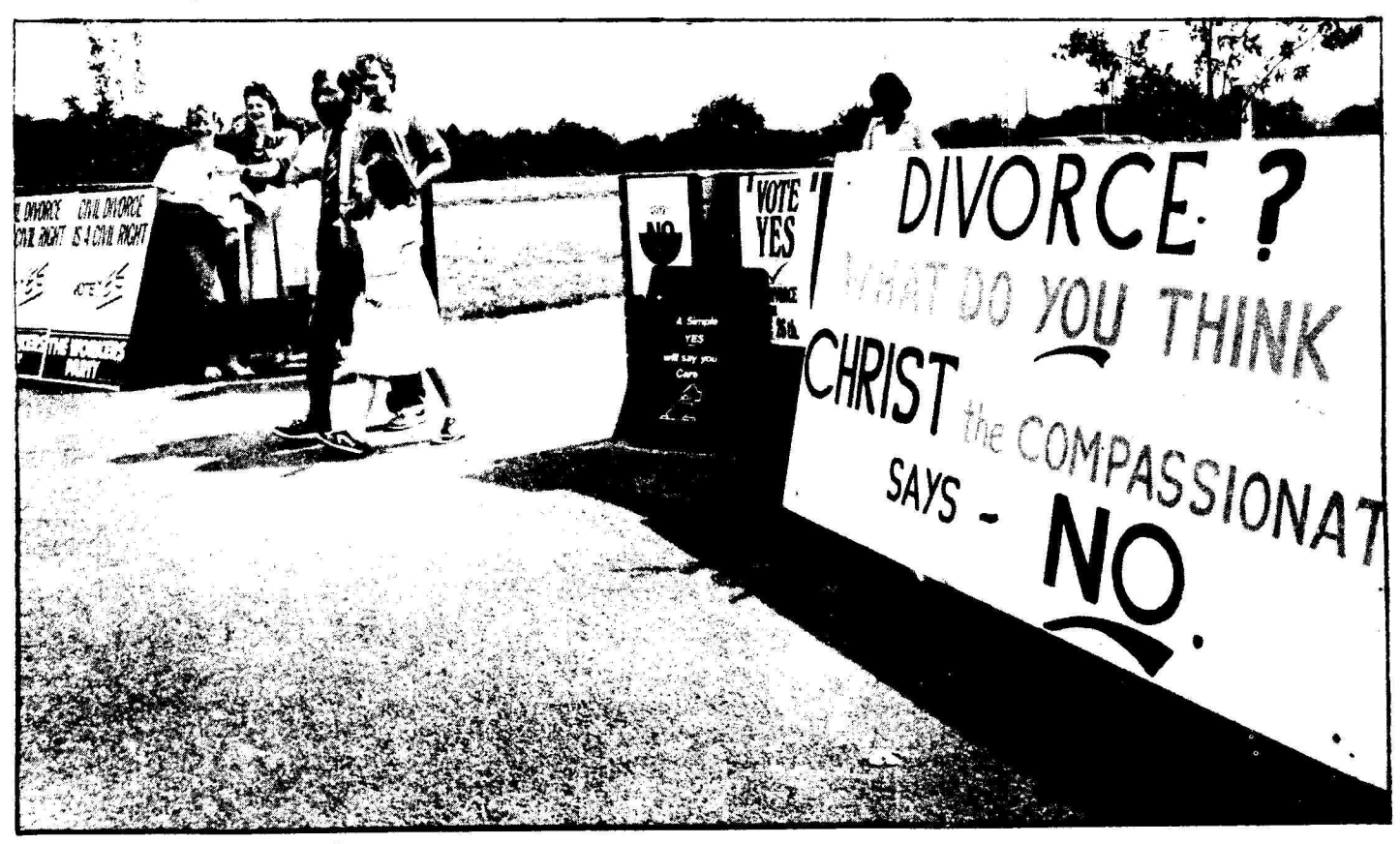
Leixlip: Christ versus civil rights

The striking common feature of 1937 and today is that the same social forces are united in their opposition to democratic rights for women - the church, the catholic nationalists of Fianna Fail and the traditionalist right of Fine Gael. The campaigns of the two periods experienced similiar obstacles for example in the schism between the Feminist and Republican movements was seen in the divorce campaign as it was in the 1937 anti-constitution campaign.