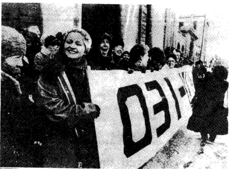
Defend the ... Clinics, campaign supporters outside the Four Courts

The campaign must be a single issue mass action campaign in defence of the full clinics services. It must be broad based and non-exclusive in character. No one, no organization is excluded as long as they support the aims of the campaign. It must organized along democratic lines. The campaign slogans and orientation must seize upon the weakest link in the enemies' chain of defence. The weakest link in the chain is the denial of information to women - in this case information on abortion. It is around the question of freedom of information that we can best challenge all the political forces in Irish society. Bourgeois democracy prides itself on freedom of information and speech, the Free State Constitution acknowledges these rights yet they are denied to Women. We must not adopt the approach of overloading the struggle before it gets off the ground. People's Democracy, like the majority of activists in the campaign is in favour of women having the right to choose abortion in Ireland but that cannot be the basis of the campaign. Rather, we seek to win this round of the struggle against SPUC and re-establish the referral services of the clinics. It is only by pushing back this latest offensive and making the judgement against the clinics unworkable that we can create the conditions in which a broader struggle for women's rights is possible. Through the clinics campaign, we will, as in the abortion amendment campaign,