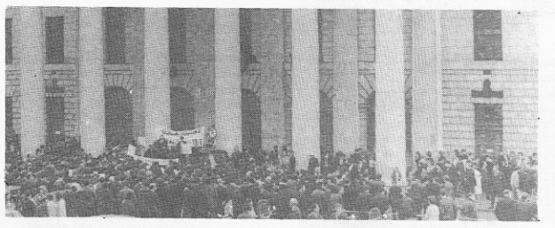
A DHAC meeting of the time at the GPO

The Irish Press reported: "A few burly Gardai sent young men reeling onto the pave- police behaved incorrectly and had no idea ment. As the wave of violence would die down of how to deal with a socially motivated the bulk of the crowd would move out again onto the road but at no time did they attempt to charge the Gardai, even when the Gardai