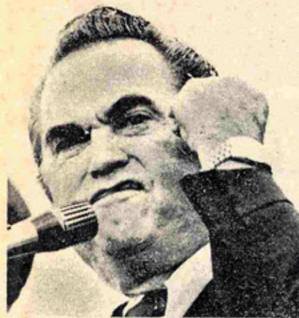
Workers support Racist Demagogue Wallace for want of an alternative.

George Wallace, the gathering in Alabama received in the De- the equally powerful ground- McGovern all indicate the under USA at present.