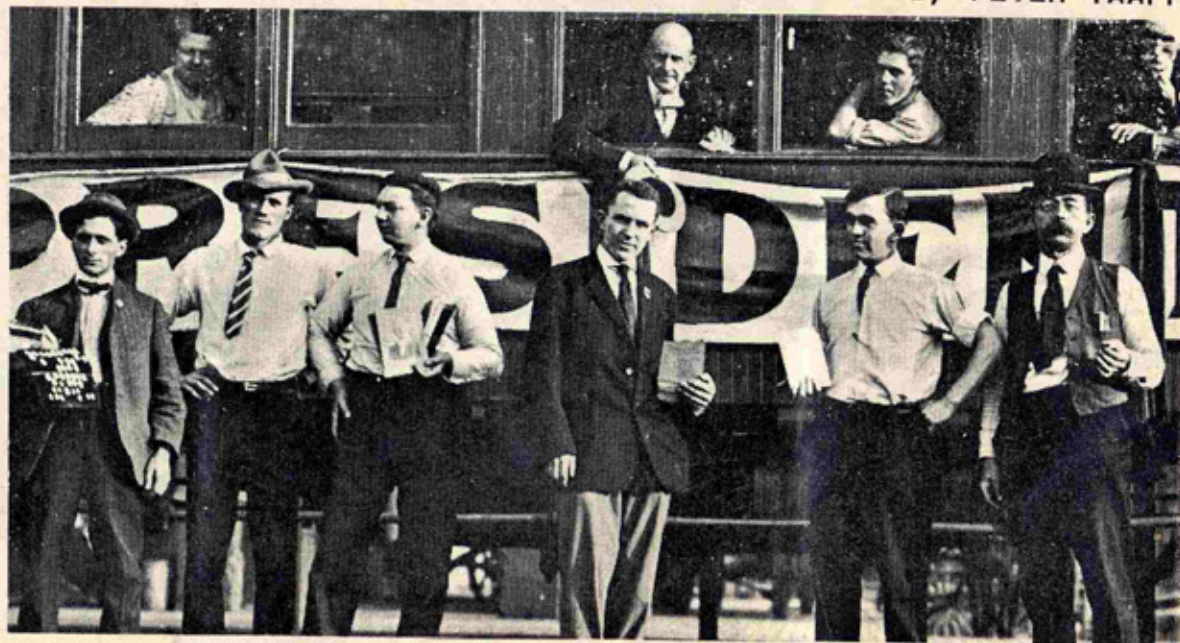
Eugene Debbs aboard his 'Red Express' Campaign Train in 1912

At the same time neither he, nor Wallace, nor Nixon can begin to solve the nightmarish problems which face American society. It is rotten from top to bottom. McGovern in power will tear away from the Democratic 'liberals' their last tawdry rags. If Nixon remains for another term he