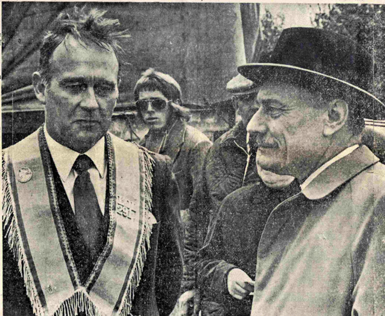
Craig and Powell - Enemies of British and Irish Workers

When a serious class lead is given, the NILP can make important gains. In a by-election for Coleraine council in 1971, the local Labour Party fought on a programme including such demands as a freeze on rents, cancellation of all housing debts and government provision of interest-free loans to local authorities. In the