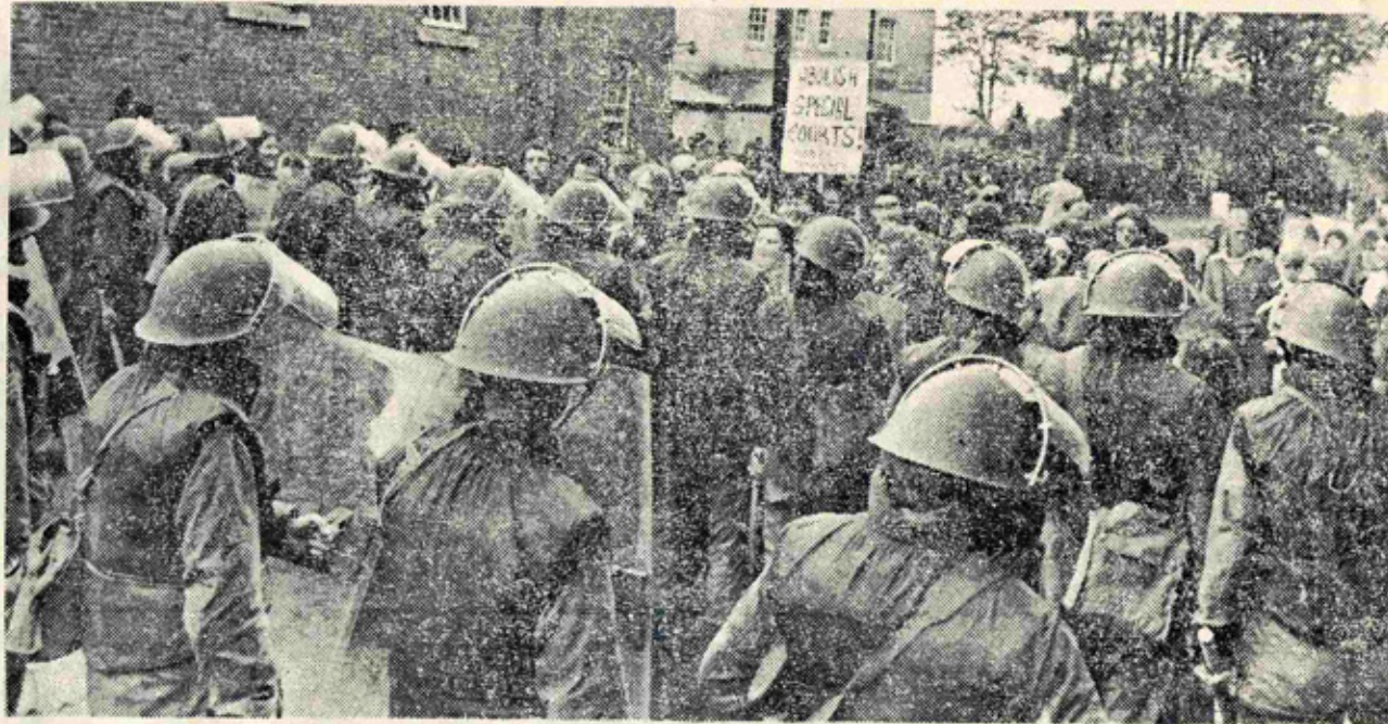
Irish Troops advance against Demonstration against Special Courts