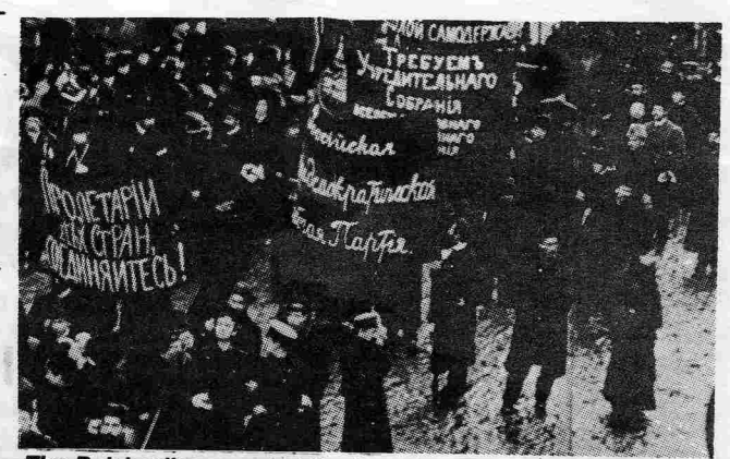
The Bolsheviks regarded the Russian workers as the leading force in the revolution: here is a workers' demonstration in 1905