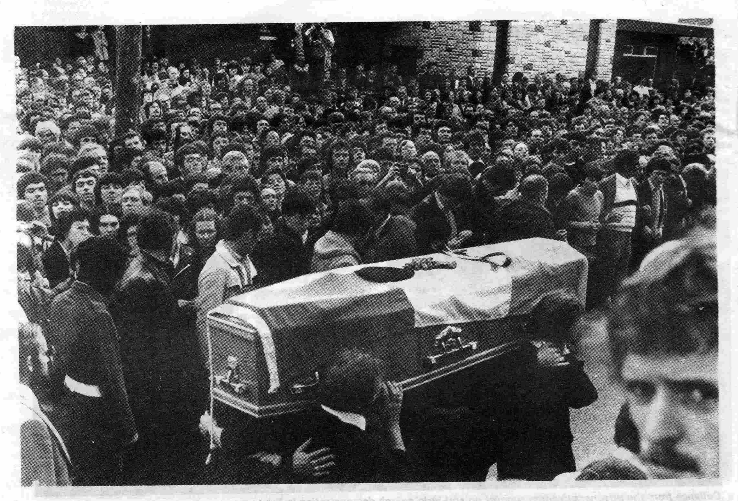
The funeral of H-block hunger-striker Martin Hurson

withdrawal of British troops, but the destruction of the six-county state; it means ruthless opposition to all tendencies in the working class who oppose Ireland's national rights or equivocate on the issue; it means in particular British Trotskyists must oppose the chauvinistic pro-imperialist tendency in the British labour leadership which has supported and assisted the occupation. Support for the right to Irish national self-determination also means active defence of the Republican movement and its right to carry out the armed struggle with whatever methods it sees fit.