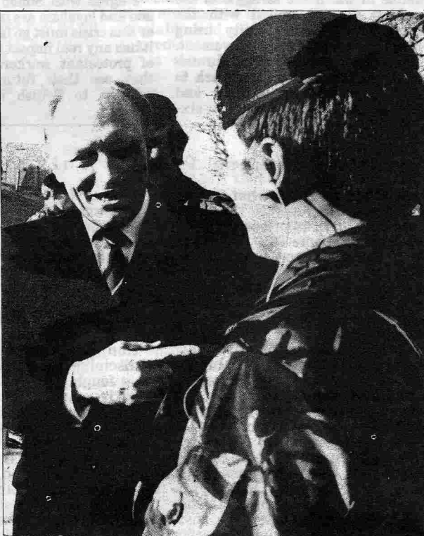
Labour leaders are imperialism's most slavish supporters

SECONDLY, we must condemn the miserable hypocrisy expressed over Enniskillen by capitalist politicians, and their aides in press and churches. This fitted in well with the crocodile tears they shed every Remembrance Day for the victims of two imperialist wars generated by the system they represent. Just as they mourn the war dead—remaining silent about the US-British holocaust against Dresden, Hamburg, Hiroshima and Nagasaki—so they condemn the IRA, while upholding the blood-soaked occupation of Ireland's six counties with its civilian deaths and misery, not to mention the centuries of previous colonial oppression.