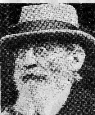
Eduard Bernstein . . . reformist leader of German Social-Democracy

with such thoroughness, and at such a high theoretical level, as in Russia. The split of the first Russian Marxists from the revolutionary terrorist 'People's Will' group in 1883; the strike struggles of the 1890s; the building of the Russian Social-Democratic Labour Party (RSDLP), formed in 1898 and split between Bolsheviks and Mensheviks in 1903; the 1905 revolution which saw the world's first workers' councils (soviets) — these experiences, and the ability of revolutionaries to learn from them, produced the party which was able to lead the Russian revolution.