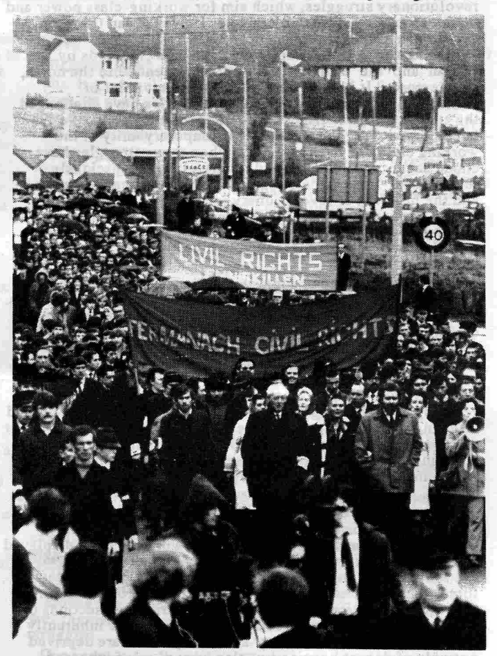
The struggle of the last 20 years 'objectively part of the struggle for socialism'

The proof of the indissoluble connection between the solution of the national question and the whole world socialist revolution is the historical paralysis of the Irish bourgeoisie: it played a revolutionary role in 1798 but failed to end British colonial domination; in the 1830s it had already split the national movement along class lines; by the beginning of the