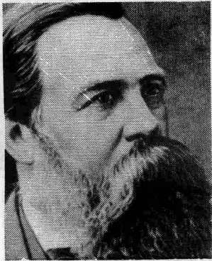
Frederick Engels . . . the syndicalists ignored his writings on the state

In the US, there was no working-class electoral party at all. But the unions were clearly divided: between the pro-imperialist American Federation of Labour (AFL) led by Samuel Gompers, and the revolutionary syndicalist