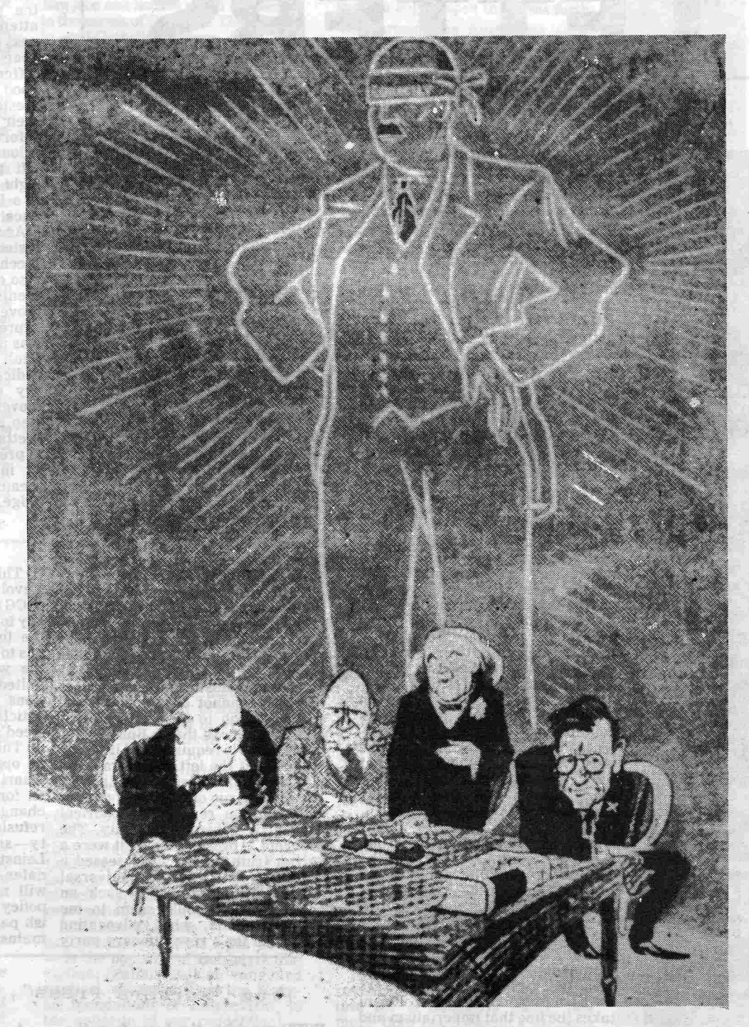
Connolly towering above bourgeois politicians of his time (from a British Communist Party pamphlet of 1921)

Although Adams refers to 'social revolution', he leaves its meaning vague. When he says 'productive capital investment for the planned economic development of