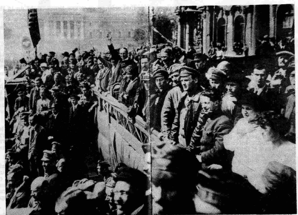
Delegates to the second Comintern congress at a Red Army parade: the Russian Bolsheviks found the second the congresses to bring the lessons of their history to the international movement.

There was no country where the struggle between socialists were conducted