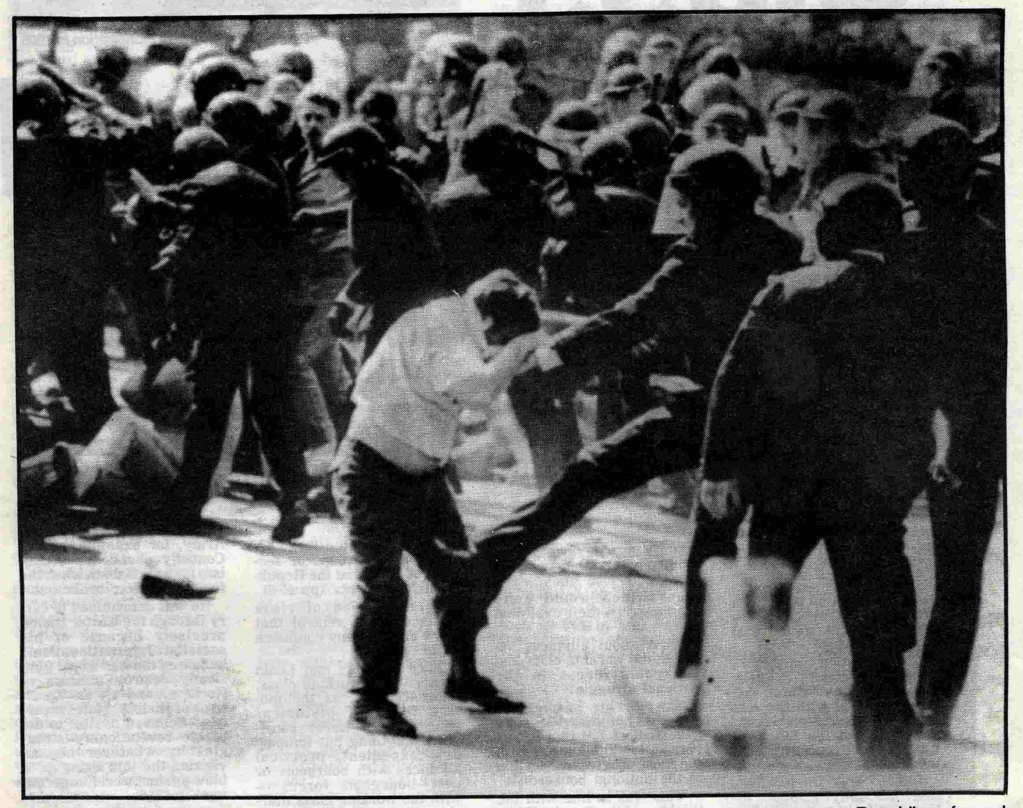
RUC policemen batoning mourners at a Republican funeral