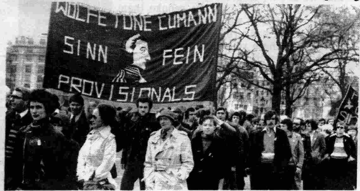
A 'Troops Out' march in London

In the early 1960s, the British Socialist Labour League (SLL) helped to form a Trotskyist organisation in Ireland, which won many shop stewards to its ranks, and won control of the youth movement. of the Northern Ireland Labour Party. But the Healy leadership of the SLL had already adopted a practice of imposing