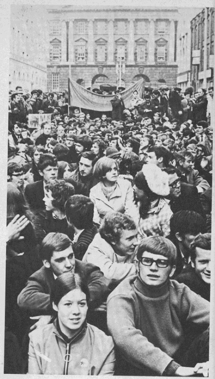
Members of PD stage a sit-down strike outside the City Hall at the start of the Civil Rights Campaign in October 9, 1968.