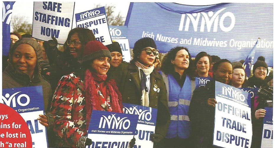
Nurses on strike in 2019 proved once again just how vital they are

The UN says 25 years of gains for women could be lost in one year — with “a real risk of reverting to 1950s gender stereotypes”