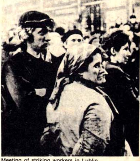
Meeting of striking workers in Lublin

Because the bureaucracy plays a parasitic role, it is not necessary for the workers to change the economic structures in order to achieve power. The bureaucracy plays a political role in guarding its own existence and it has to do this by totalitarian methods because