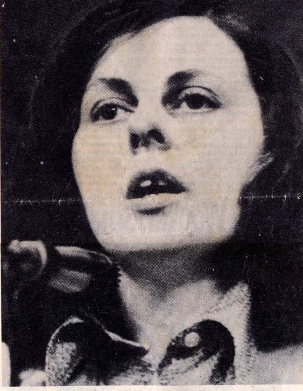
people. Because Bernadette understood this simple truth and was convincing many more, she has been the victim of the assassin's

The only force strong enough to send the British government packing once and for all is the mass mobilisation of the Irish