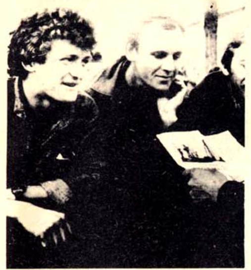
Workers in Gdansk discussing strike news

Free Trade Unions Grow From Strength To Strength